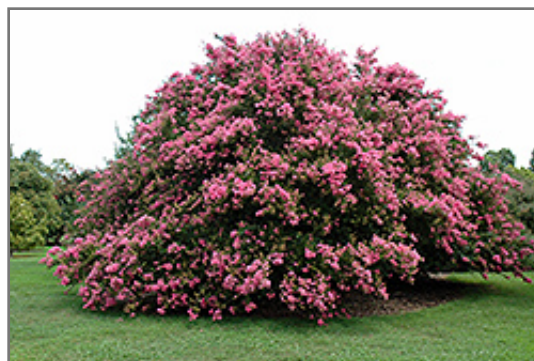
Seminole Crapemyrtle in bloom