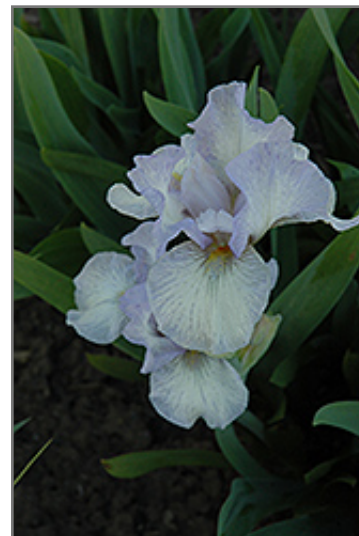
Ain't She Sweet Iris flowers