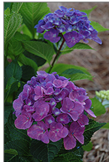
Cityline Venice Dwarf Hydrangea flowers

Cityline Venice Dwarf Hydrangea is recommended for the following landscape applications;