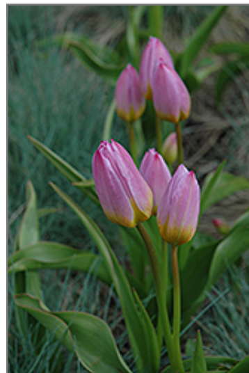
Lilac Wonder Tulip flowers