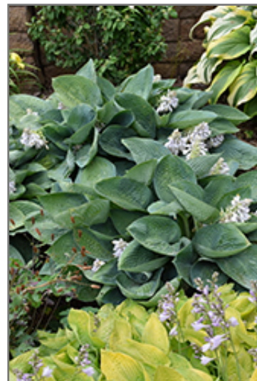
Blue Vision Hosta