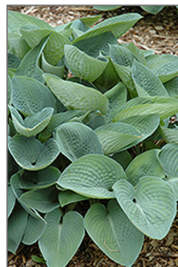
Blue Vision Hosta foliage