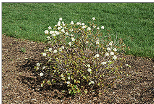
Red Monarch Fothergilla in bloom