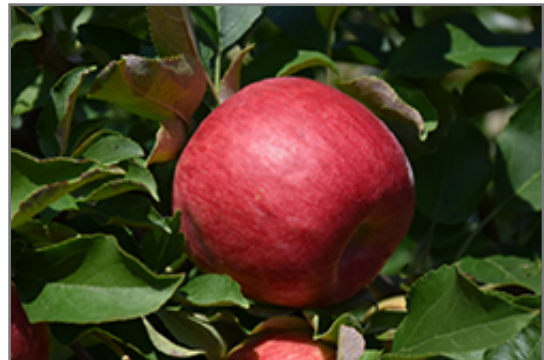
Novamac Apple fruit

This is a deciduous tree with a more or less rounded form. Its average texture blends into the landscape, but can be balanced by one or two finer or coarser trees or shrubs for an effective composition. This is a high maintenance plant that will require regular care and upkeep, and is best pruned in late winter once the threat of extreme cold has passed. Gardeners should be aware of the following characteristic(s) that may warrant special consideration;