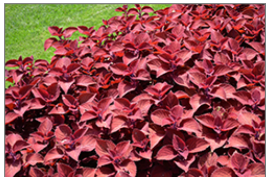
Ruby Slippers Coleus foliage