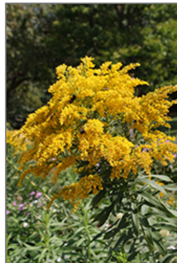
Tall Goldenrod flowers

Tall Goldenrod is recommended for the following landscape applications;