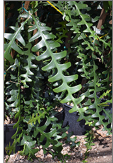
Fishbone Cactus foliage

Fishbone Cactus is recommended for the following landscape applications;