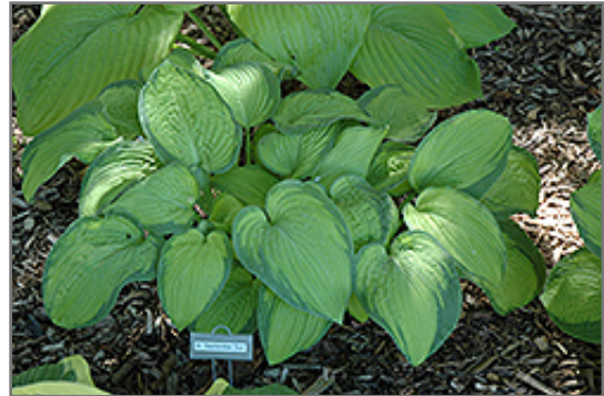
September Sun Hosta