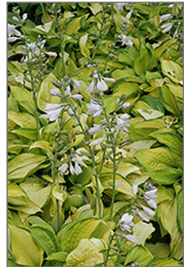
September Sun Hosta in bloom