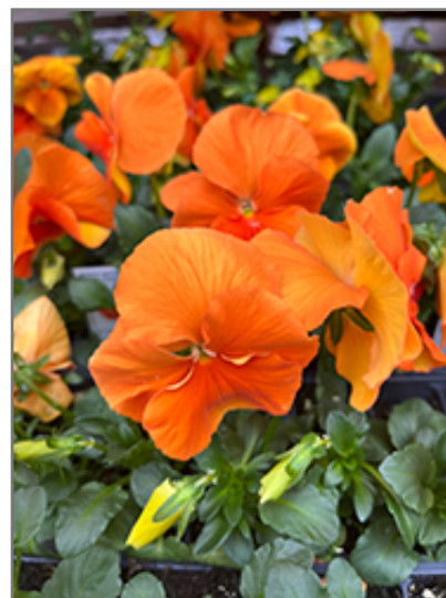
Spring Matrix Deep Orange Pansy flowers