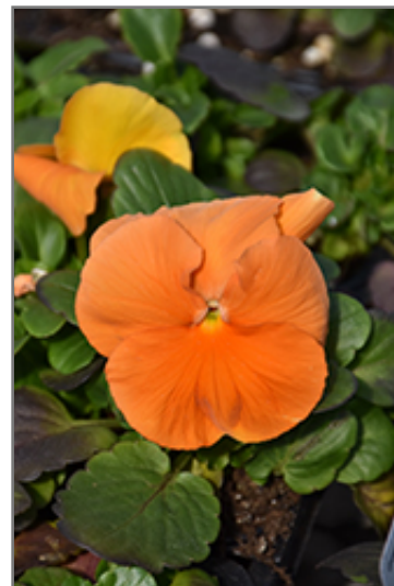
Spring Matrix Deep Orange Pansy flowers