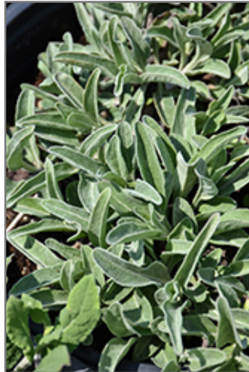
Silver Speedwell foliage