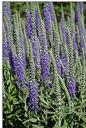
Silver Speedwell flowers