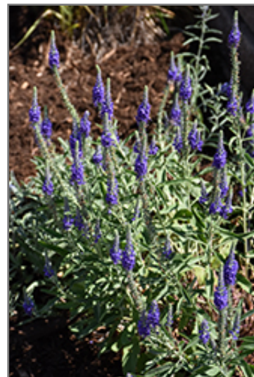
Silver Speedwell flowers

Silver Speedwell is a fine choice for the garden, but it is also a good selection for planting in outdoor pots and containers. With its upright habit of growth, it is best suited for use as a 'thriller' in the 'spiller-thriller-filler' container combination; plant it near the center of the pot, surrounded by smaller plants and those that spill over the edges. Note that when growing plants in outdoor containers and baskets, they may require more frequent waterings than they would in the yard or garden.