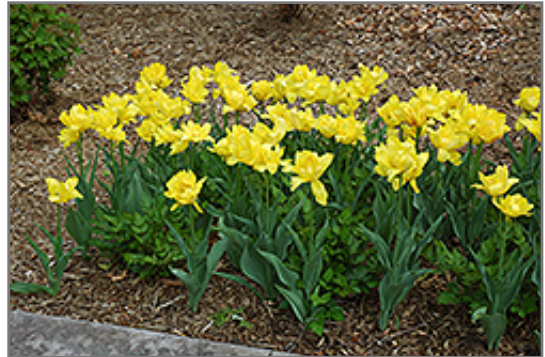
Monte Carlo Tulip in bloom