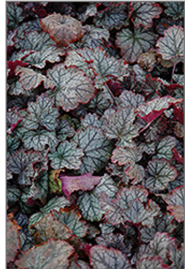
Raspberry Ice Coral Bells foliage