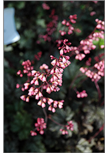
Raspberry Ice Coral Bells flowers

Raspberry Ice Coral Bells is recommended for the following landscape applications;