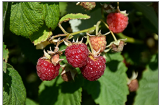
Fall Red Raspberry fruit

This is an open multi-stemmed deciduous shrub with an upright spreading habit of growth. Its relatively coarse texture can be used to stand it apart from other landscape plants with finer foliage. This is a high maintenance plant that will require regular care and upkeep. Each spring, cut back all dead and two-year old canes to the ground, leaving only last year's growth standing. It is a good choice for attracting birds to your yard. Gardeners should be aware of the following characteristic(s) that may warrant special consideration;