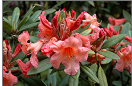
Tortoiseshell Orange Rhododendron flowers

Tortoiseshell Orange Rhododendron will grow to be about 10 feet tall at maturity, with a spread of 10 feet. It tends to be a little leggy, with a typical clearance of 1 foot from the ground, and is suitable for planting under power lines. It grows at a slow rate, and under ideal conditions can be expected to live for 40 years or more.