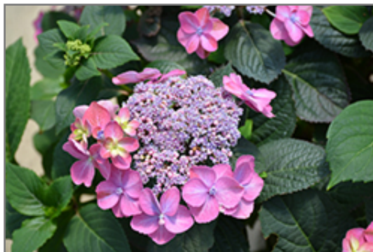
Tuff Stuff Hydrangea flowers

Tuff Stuff Hydrangea makes a fine choice for the outdoor landscape, but it is also well-suited for use in outdoor pots and containers. With its upright habit of growth, it is best suited for use as a 'thriller' in the 'spiller-thriller-filler' container combination; plant it near the center of the pot, surrounded by smaller plants and those that spill over the edges. It is even sizeable enough that it can be grown alone in a suitable container. Note that when grown in a container, it may not perform exactly as indicated on the tag - this is to be expected. Also note that when growing plants in outdoor containers and baskets, they may require more frequent waterings than they would in the yard or garden.