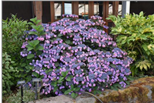
Tuff Stuff Hydrangea in bloom