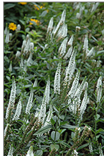
First Lady Speedwell flowers

A compact selection, great for borders, containers, and rock gardens; numerous spikes of brilliant white flowers starting in early summer; prune spent blooms to encourage re-blooming