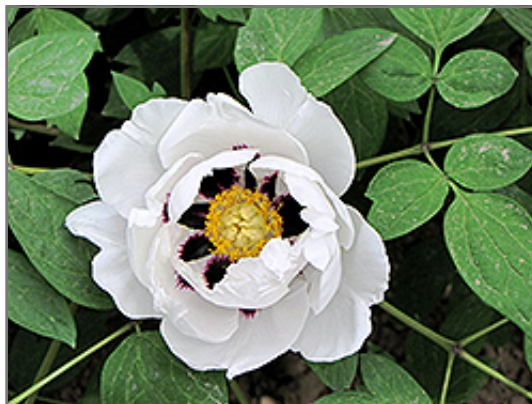
Shu Sheng Peng Mo Tree Peony flowers

Shu Sheng Peng Mo Tree Peony will grow to be about 6 feet tall at maturity, with a spread of 5 feet. It has a low canopy, and is suitable for planting under power lines. It grows at a slow rate, and under ideal conditions can be expected to live for 50 years or more.