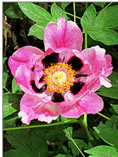
Hui He Tree Peony flowers

Hui He Tree Peony will grow to be about 3 feet tall at maturity, with a spread of 4 feet. It has a low canopy. It grows at a slow rate, and under ideal conditions can be expected to live for 50 years or more.