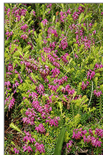
Myretoun Ruby Heath flowers