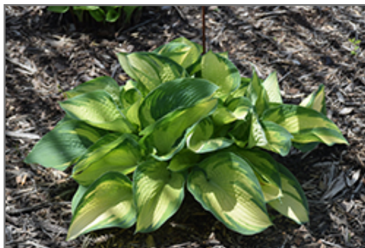
Eskimo Pie Hosta