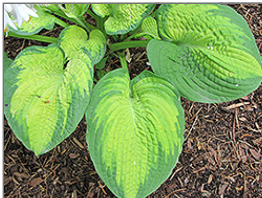
Eskimo Pie Hosta foliage

Eskimo Pie Hosta is recommended for the following landscape applications;