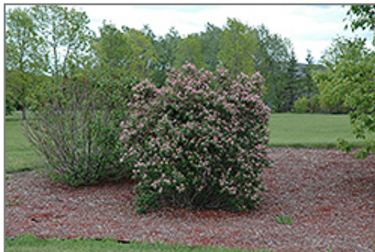
Honeyrose Honeysuckle in bloom