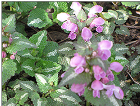
Roseum Spotted Dead Nettle flowers