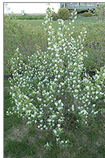
Pembina Saskatoon in bloom

Pembina Saskatoon is blanketed in stunning clusters of white flowers rising above the foliage from early to mid spring before the leaves. It has dark green deciduous foliage. The oval leaves turn an outstanding yellow in the fall. It features an abundance of magnificent blue berries in late spring.