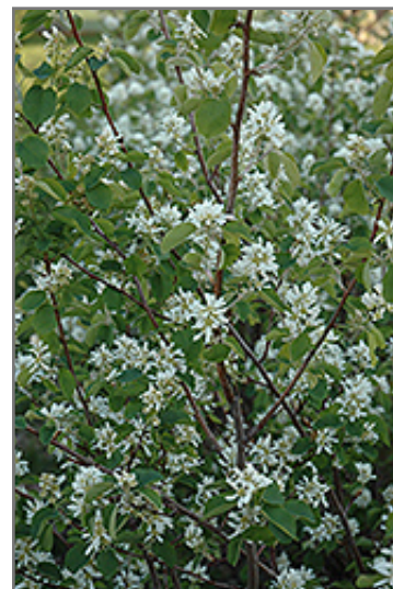
Pembina Saskatoon flowers