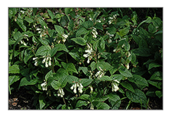
Ground Cover Comfrey flowers