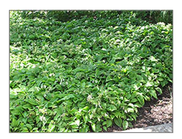
Ground Cover Comfrey in bloom