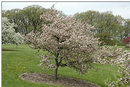
Leprechaun Flowering Crab in bloom