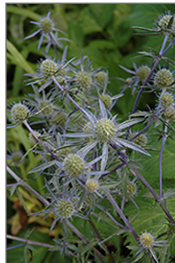
Blue Cap Sea Holly flowers