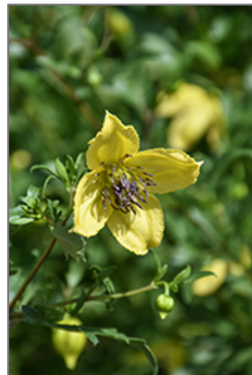
Mongolian Gold Clematis flowers