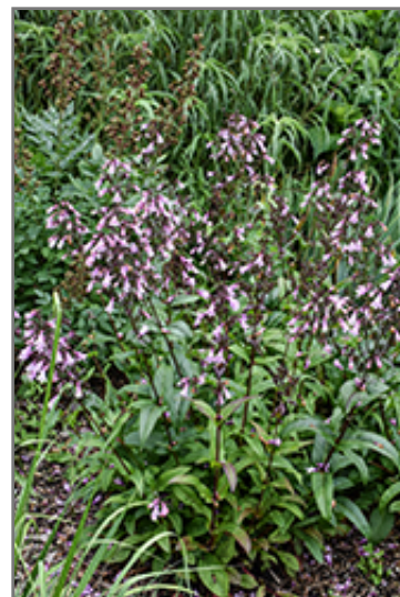
Dakota Verde Beard Tongue in bloom