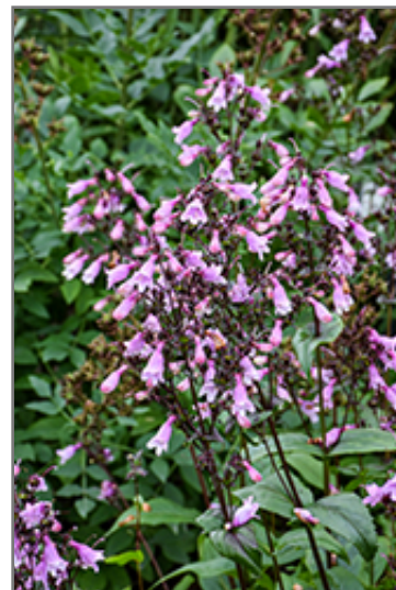
Dakota Verde Beard Tongue flowers

Dakota Verde Beard Tongue is an herbaceous perennial with an upright spreading habit of growth. Its medium texture blends into the garden, but can always be balanced by a couple of finer or coarser plants for an effective composition.