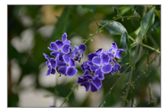
Sweet Memories Duranta flowers

This shrub will require occasional maintenance and upkeep, and should only be pruned after flowering to avoid removing any of the current season's flowers. It is a good choice for attracting birds and butterflies to your yard. It has no significant negative characteristics.