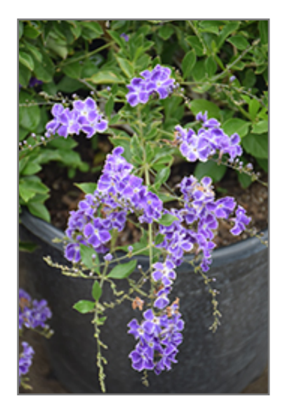
Sweet Memories Duranta flowers