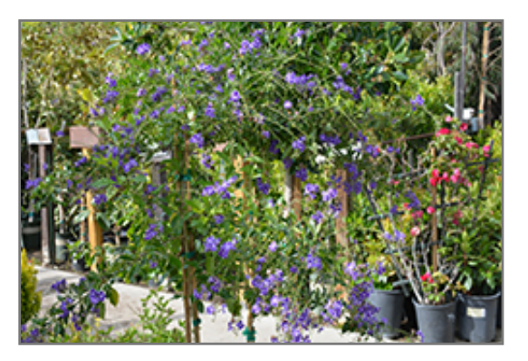
Sweet Memories Duranta in bloom

Sweet Memories Duranta will grow to be about 15 feet tall at maturity, with a spread of 8 feet. It has a low canopy with a typical clearance of 1 foot from the ground, and is suitable for planting under power lines. It grows at a medium rate, and under ideal conditions can be expected to live for 40 years or more.