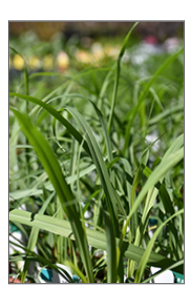
Lemon Grass foliage

Aside from its primary use as an edible, Lemon Grass is sutiable for the following landscape applications;