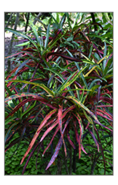
Zanzibar Variegated Croton foliage

When grown indoors, Zanzibar Variegated Croton can be expected to grow to be about 3 feet tall at maturity, with a spread of 24 inches. It grows at a medium rate, and under ideal conditions can be expected to live for approximately 10 years. This houseplant will do well in a location that gets either direct or indirect sunlight, although it will usually require a more brightly-lit environment than what artificial indoor lighting alone can provide. It does best in average to evenly moist soil, but will not tolerate standing water. The surface of the soil shouldn't be allowed to dry out completely, and so you should expect to water this plant once and possibly even twice each week. Be aware that your particular watering schedule may vary depending on its location in the room, the pot size, plant size and other conditions; if in doubt, ask one of our experts in the store for advice. It will benefit from a regular feeding with a general-purpose fertilizer with every second or third watering. It is not particular as to soil pH, but grows best in rich soil. Contact the store for specific recommendations on pre-mixed potting soil for this plant. Be warned that parts of this plant are known to be toxic to humans and animals, so special care should be exercised if growing it around children and pets.