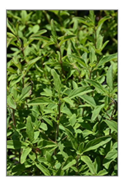
Forked Bluecurls foliage