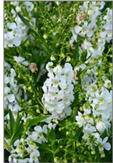
Angelwings White Angelonia flowers

This plant will require occasional maintenance and upkeep, and should not require much pruning, except when necessary, such as to remove dieback. It is a good choice for attracting butterflies to your yard, but is not particularly attractive to deer who tend to leave it alone in favor of tastier treats. It has no significant negative characteristics.