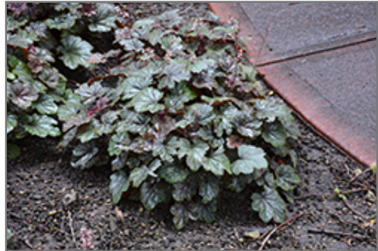
Steel City Coral Bells

Steel City Coral Bells is recommended for the following landscape applications;