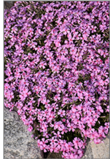
Eye Candy Creeping Phlox in bloom