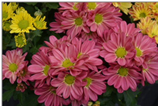
Hilo Mango Chrysanthemum flowers