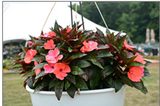
Painted Select Salmon New Guinea Impatiens in bloom