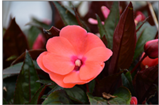
Painted Select Salmon New Guinea Impatiens flowers

Painted Select Salmon New Guinea Impatiens is recommended for the following landscape applications;