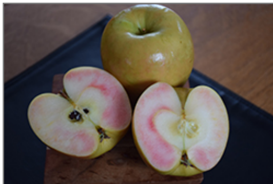
Pink Pearl Apple fruit and flesh

Pink Pearl Apple features showy clusters of lightly-scented white flowers with shell pink overtones along the branches from early to mid spring, which emerge from distinctive red flower buds. It has forest green deciduous foliage. The pointy leaves turn yellow in fall. The fruits are showy chartreuse apples with a rose blush, which are carried in abundance from mid to late summer. The fruit can be messy if allowed to drop on the lawn or walkways, and may require occasional clean-up.