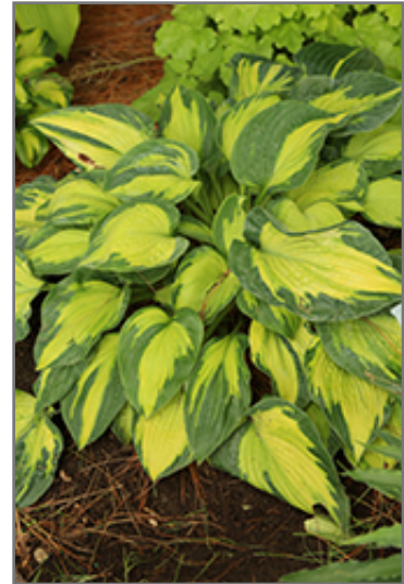
Sister Act Hosta