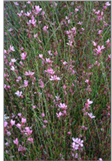
Bantam Pink Gaura in bloom

This is a relatively low maintenance plant, and is best cleaned up in early spring before it resumes active growth for the season. It is a good choice for attracting butterflies to your yard, but is not particularly attractive to deer who tend to leave it alone in favor of tastier treats. It has no significant negative characteristics.