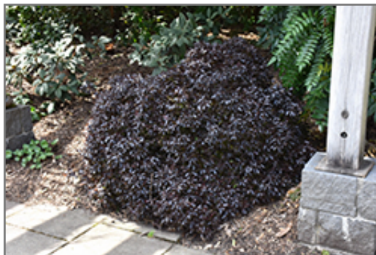
Tom Thumb Kohuhu

Tom Thumb Kohuhu is recommended for the following landscape applications;