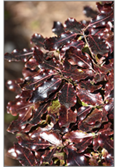
Tom Thumb Kohuhu foliage

This shrub does best in full sun to partial shade. It does best in average to evenly moist conditions, but will not tolerate standing water. It is not particular as to soil type or pH. It is somewhat tolerant of urban pollution. This is a selected variety of a species not originally from North America.