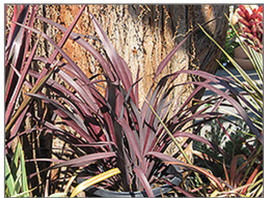
Dark Delight New Zealand Flax