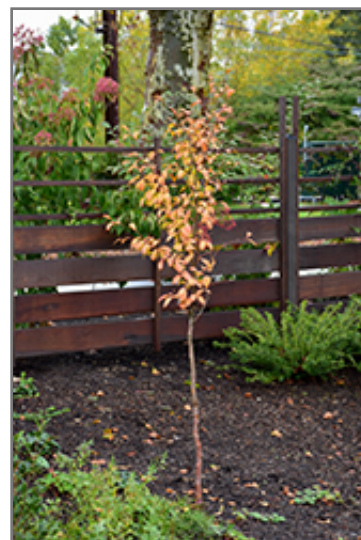
Milk And Honey Japanese Stewartia in fall