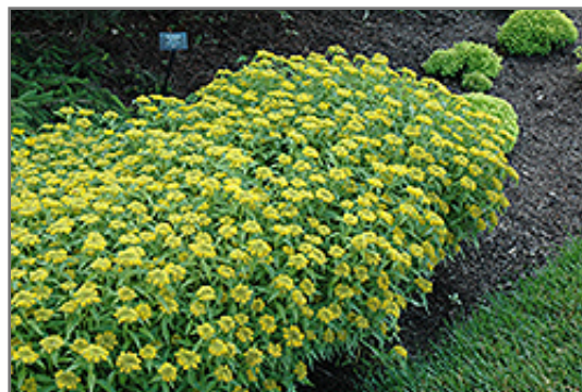
Aizoon Stonecrop in bloom