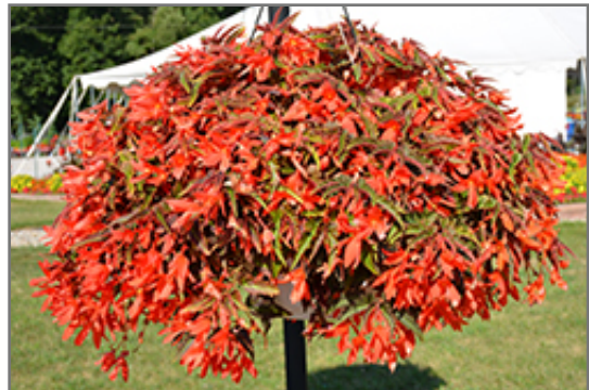
Bossa Nova Night Fever Papaya Begonia in bloom