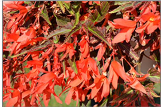
Bossa Nova Night Fever Papaya Begonia flowers