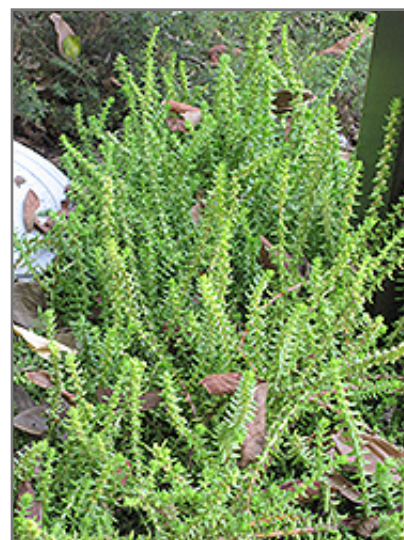
Watch Chain Crassula