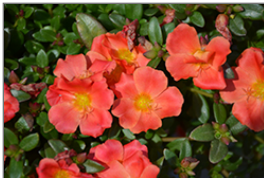
Pazzaz Orange Flare Portulaca flowers

Pazzaz Orange Flare Portulaca is recommended for the following landscape applications;